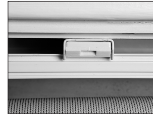
Figure 4 – Top Mount

Hold the shade up against the brackets and push in the clear tab on the back of each bracket to allow the head rail to snap into place. [Figure 4 & 5]