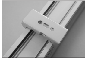
Figure 1 – Cordless head rail & bracket