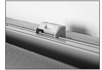
Figure 5 – Face Mount