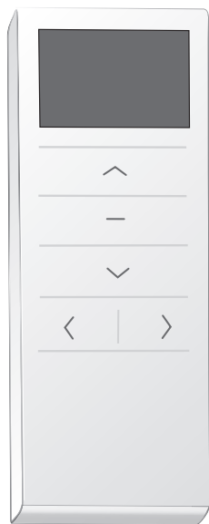
FRONT OF REMOTE

"Soft Stop" is a feature available on remote control motors that can be turned off or on. When "Soft Stop" is turned on, the shade movement will slow as the shade approaches its upper, lower, or middle stop limits. Shades ship with this feature automatically turned off.