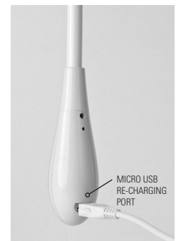
figure 2: Back of wand