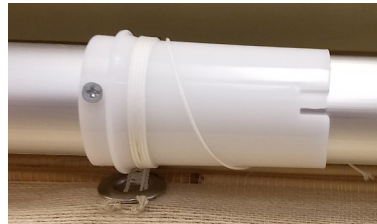
figure 4: Lift Cord on Spool